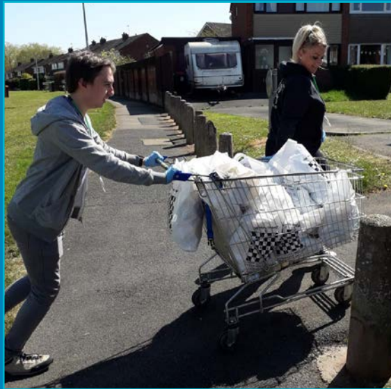
Sutton Hill Community Trust, Telford

Now we have the opportunity to embed this change for the long term, and to knit it into the way our communities and local economies start to recover and rebuild. We must ensure that the wave of community spirit that has been unleashed by Covid-19 sticks for the long term and can be developed in all communities. Doing this is the crucial first step to building a better, more equal future out of this national crisis. This is an opportunity we cannot afford to miss.