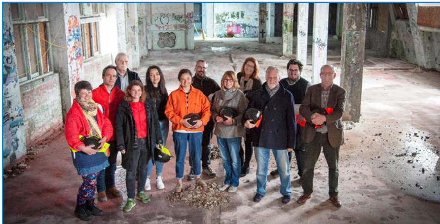
Observer Building, Hastings, one of the organisations behind Isolation Station Hastings

Community organisations are imbued with entrepreneurialism, a passion for their community and a deep knowledge of what their community needs. That means they can respond rapidly to crisis, and many are doing so regardless of the financial challenges they face. This ability to innovate at speed will be essential as we enter a new and challenging world post-crisis.