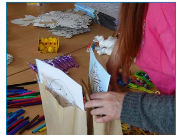
The Annexe, Hartlepool

A shift like this will take time to work through the system. It won't happen overnight. But this crisis offers us a chance to take the first step on a journey we simply have to make. As we respond to the immediate demands of the crisis, we must keep in mind a bigger, longer-term shift towards community power. Our three ideas for change are presented in that spirit – both as an immediate response to the Covid-19 crisis, and as the crucial first step which will put us on the path towards the more resilient social and economic model we need.