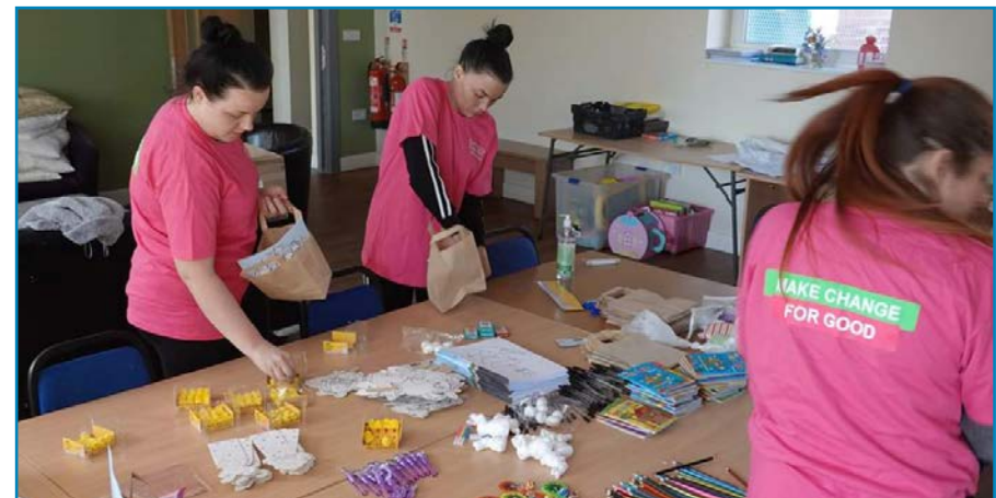
The Annexe, Hartlepool

Community spirit is everywhere. When it is properly resourced and organised, it becomes the key not just to tackling Covid-19 but also to unlocking better social outcomes and more resilient local economies in the future.