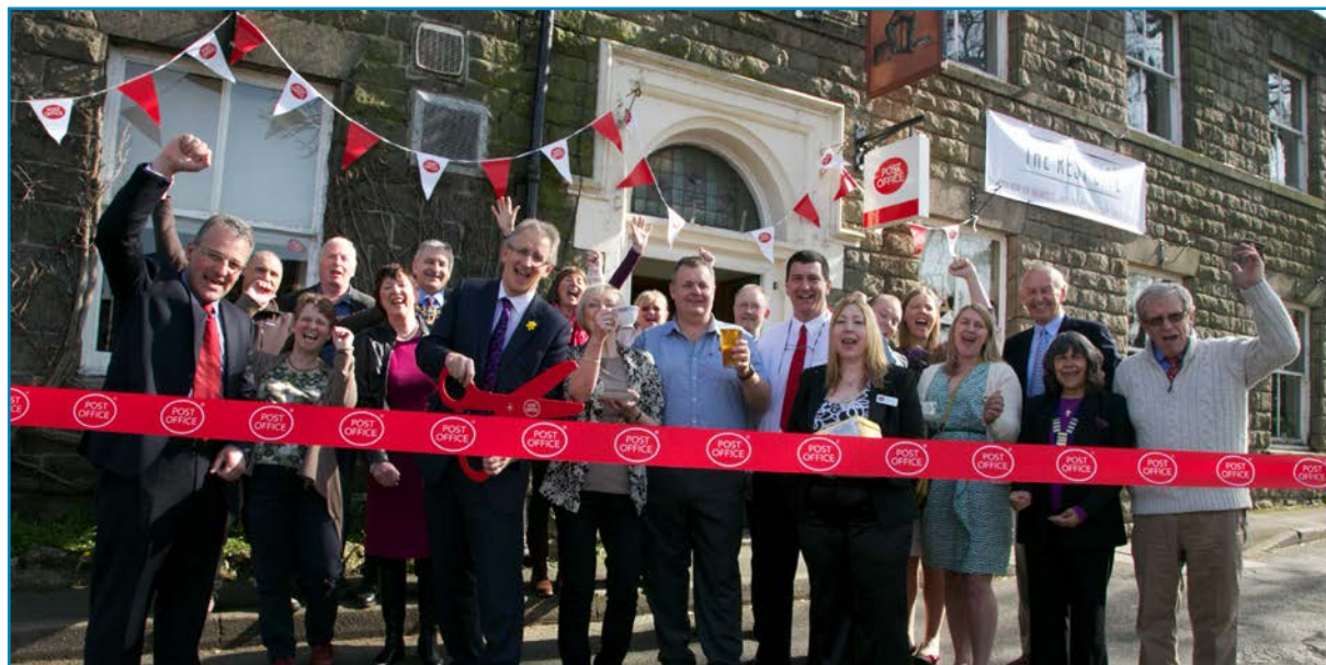
The Anglers Rest, Bamford

The devolution of taxpayer spend to community organisations can only increase this natural accountability as communities scrutinise how money is spent.